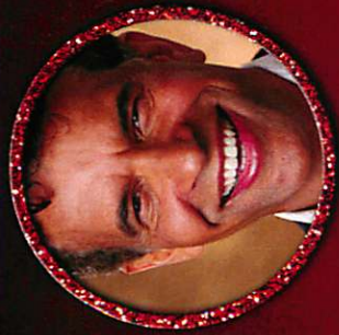
BRIAN STOKES MITCHELL